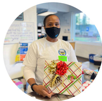
HOLIDAY MEALS & GIFTS