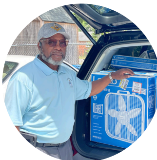
SUMMER BOX FAN PROGRAM