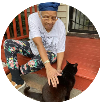
PET FOOD PROGRAM